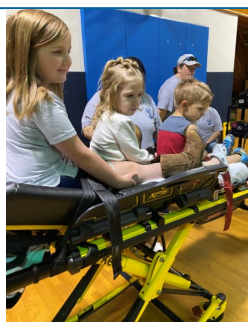
The Tri-Towns EMS came to visit.